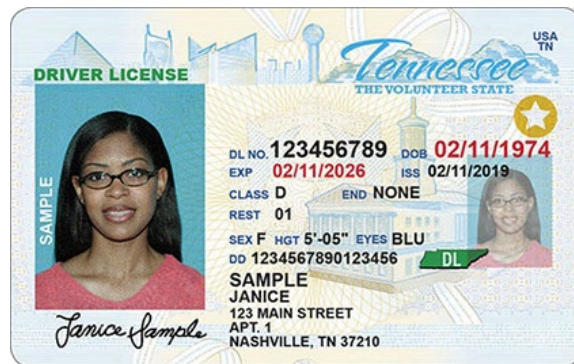
Figure 2-Legacy Real ID-Pre-2024

In early 2013, the National Security Council Staff convened an Interagency Policy Committee to develop a plan to ensure that enforcement of the Act’s prohibitions is done fairly and responsibly. This plan, announced on December 20, 2013, defined the initial enforcement phases and established a schedule for their implementation. The Act doesn’t just cover Tennessee; it covers the 50 US states, the District of Columbia, and the US territories of Puerto Rico, the US Virgin Islands, Guam, American Samoa, and