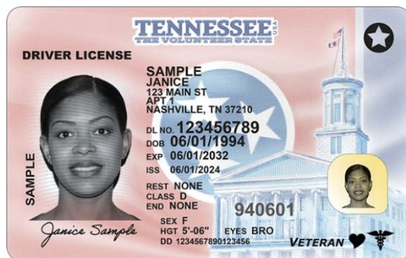
Figure 1-REAL ID Revision

The REAL ID Act of 2005 was enacted in response to a 9/11 Commission recommendation that the federal government “set standards for the issuance of sources of identification, such as driver’s licenses.” 1 The Act established minimum security standards for license issuance and production and assigned the Department of Homeland Security (DHS) the responsibility for determining whether a state is meeting these standards.