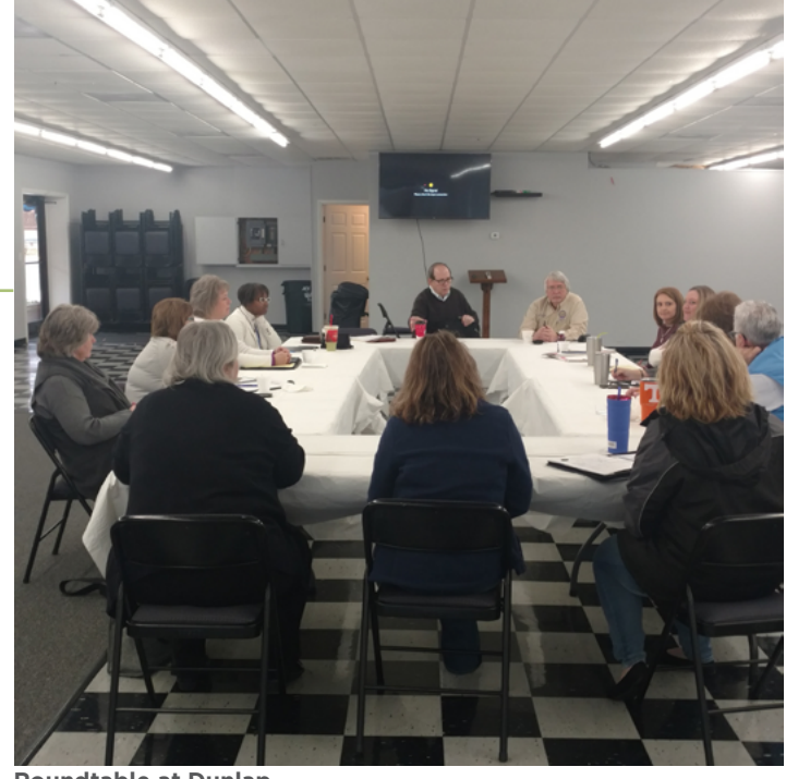
Roundtable at Dunlap

mtas.tennessee.edu/finance-and-accounting