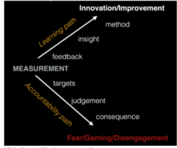
Slide from Miller's presentation

Send comments to the MTAS Library at mtaslibrary@ tennessee.edu and we will share those back in the next issue of the E-News (without names of course!)