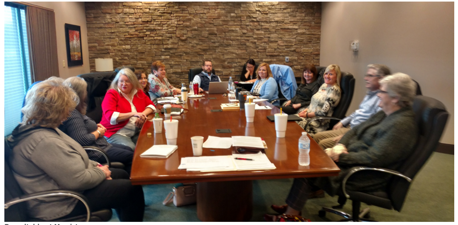
Roundtable at Morristown