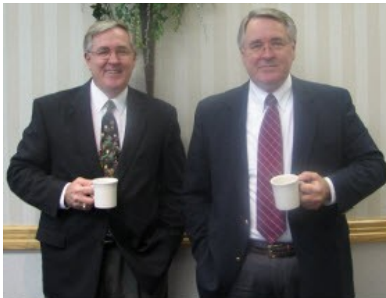
“The Darden Boys”