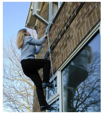
Practicing Escape from Upper Level of Home Using Portable Fire Escape Ladder

• Close the Door: Always sleep with your bedroom door closed. This practice may buy you more time by reducing the spread of smoke and toxic gases. If you are in the room where the fire starts, close the door on your way out to buy yourself and other people in the structure more time to escape.