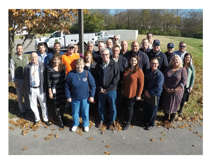
Gallatin Tennessee Municipal Management Academy level one graduates.

Congratulations to everyone who completed MMA in 2017!