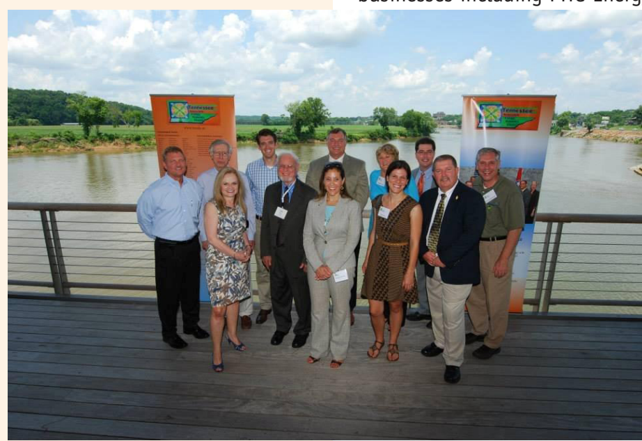
Presenters at the July 9 forum for renewable energy.

The Tennessee Department of Environment and Conservation's (TDEC) Energy Education Initiative also sponsored presentations regarding qualified conservation bonds and energy awareness. The TREEDC-Clarksville forum was the fourth of five forums organized under the Tennessee Energy Education Initiative. This initiative will be delivered in connection with TREEDC Diamond Member Pathway Lending and other statewide energy resource providers and will provide in depth training and educational tools.