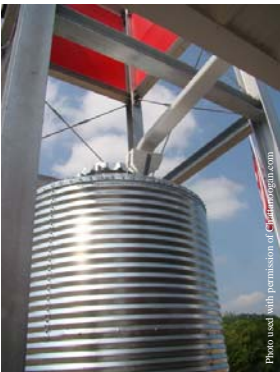
Tanks collect rain water for washing fire equipment

Chattanooga is one example of a city that was already in the construction phases when this grant became available. Chattanooga recently reopened station number 4 on Bragg Street in east