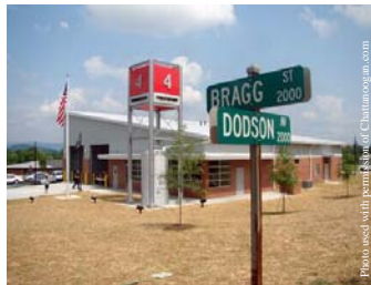
Station number 4 on Bragg Street

Many Tennessee fire departments recently applied for the Department of Homeland Security’s Assistance to Firefighters Fire Station Construction Grants (SCG), which requires new fire stations to be built “green;” however, a few fire departments already were in the process of building LEED (Leadership in Energy and Environmental Design) certified buildings before the grants became available. The United States Congress appropriated a total of $210 million for the fiscal year 2009 program. The grant application deadline was July 10, 2009.