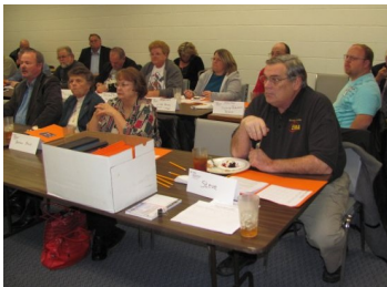
First session in Tracy City.

The training provides for Pioneer Academies, where participants may receive training in economic development, planning and zoning, and retail development. The program also provides for an MTAS Elected Officials Academy (EOA) to provide training in foundations and structures of municipal government,