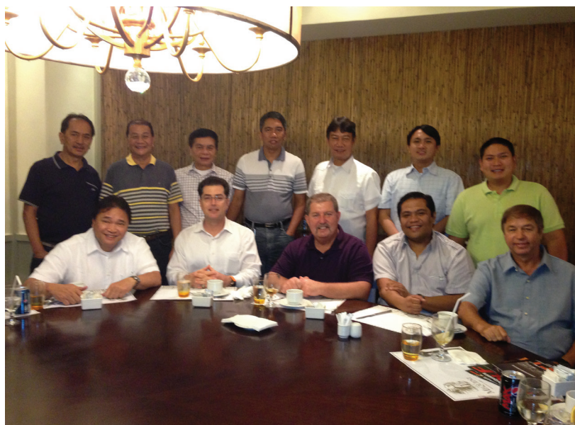
TREEDC and Mabalacat City Council

Delegates of the Tennessee Renewable Energy & Economic Development Council (TREEDC) returned to the Philippines to conduct its initial international renewable energy forums as part of the TREEDC International Exchange Program. READ