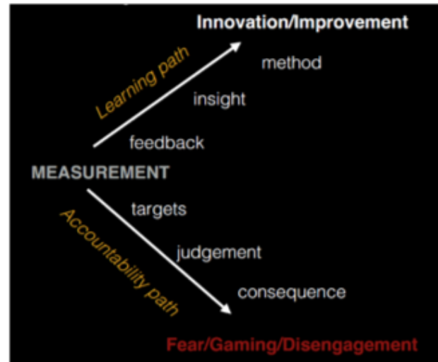
Slide from Miller’s presentation

The TMBP takes the flashlight approach, which helps cities use data to shine the light on positive staff engagement, improving processes and efficiencies, and uncovering best practices that can be shared among members.