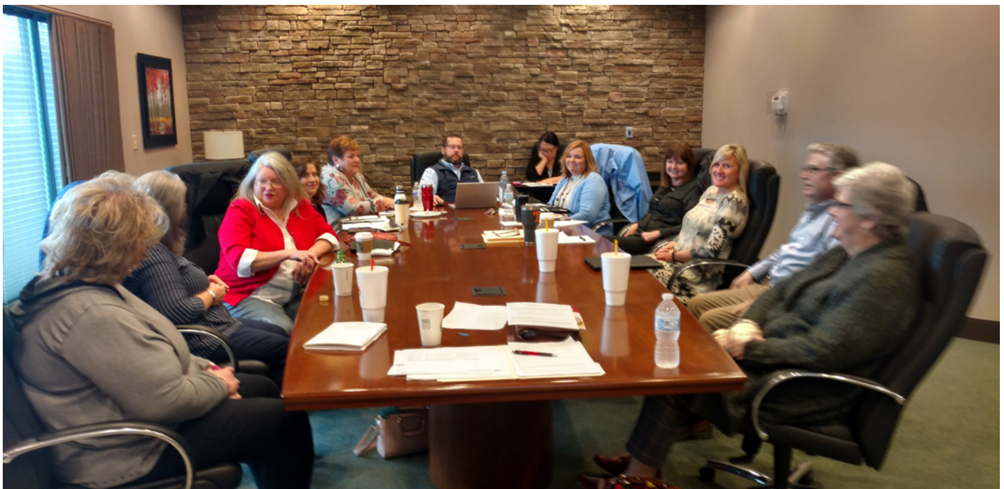
Roundtable at Morristown