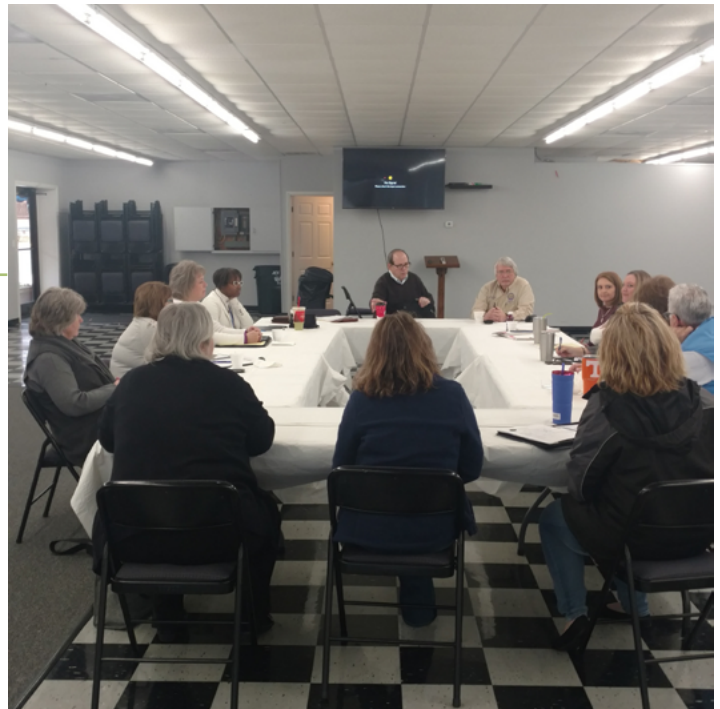
Roundtable at Dunlap

mtas.tennessee.edu/finance-and-accounting