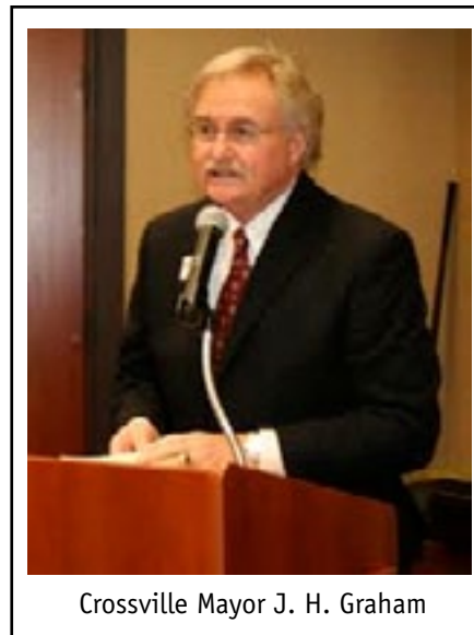
Crossville Mayor J. H. Graham

The city adopted a resolution at the May meeting approving the top four goals to be implemented during the 2013-2014 fiscal year.