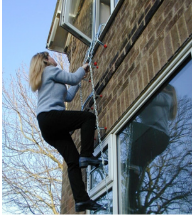
Practicing Escape from Upper Level of Home Using Portable Fire Escape Ladder

• Close the Door: Always sleep with your bedroom door closed. This practice may buy you more time by reducing the spread of smoke and toxic gases. If you are in the room where the fire starts, close the door on your way out to buy yourself and other people in the structure more time to escape.