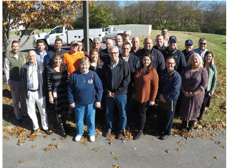
Gallatin Tennessee Municipal Management Academy level one graduates.

Congratulations to everyone who completed MMA in 2017!