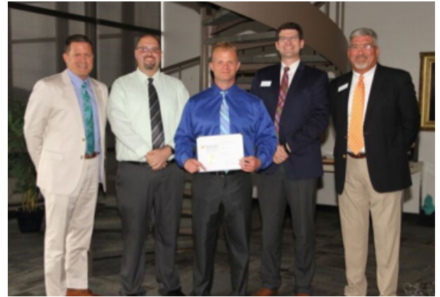
Knoxville MMA Graduation, July 2018

These individuals worked diligently, attending two classes a week for four weeks. The eight classes of level two of the academy consists of four mandatory courses and four elective MMA courses chosen by the city. The content of each class assists participants in their leadership and management skills and also provides keen insight on how and why their fellow employees work in the manner they do.