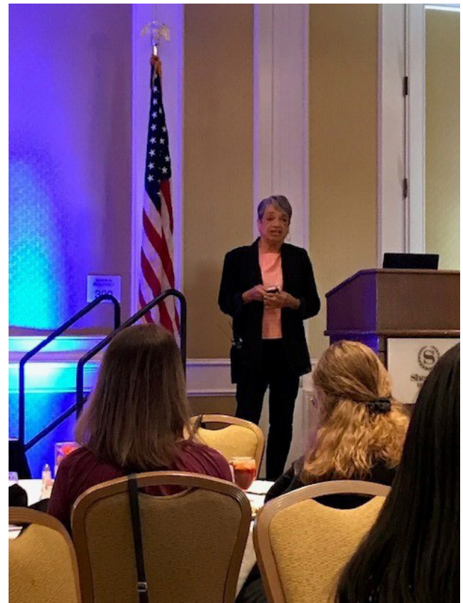
IPS welcomed Dr. Christine M. Darden, Retired Senior Staff & Researcher at the NASA Langley Research Center as the keynote speaker. Dr. Darden signed copies of the book, Hidden Figures, for employees following her speech.