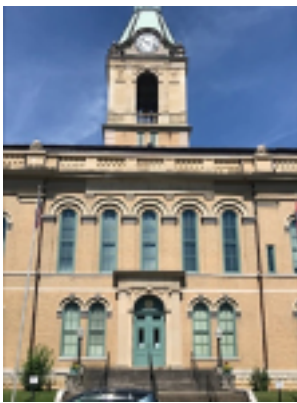
Courthouse in Columbia, TN

Court clerks need to stay current on motor vehicle violation reporting requirements to the state to protect the public from dangerous drivers, and to ensure the enforcement of laws and judicial rulings are upheld.